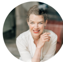
Chair, Management Board