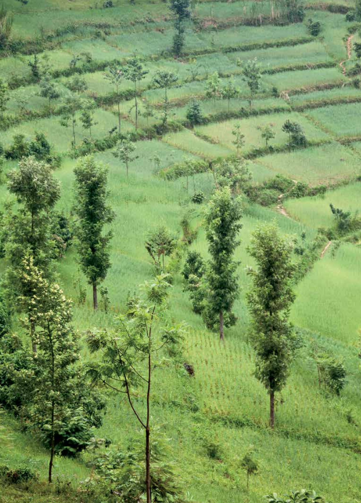
left: Afforestation between fields right: Tree plantation