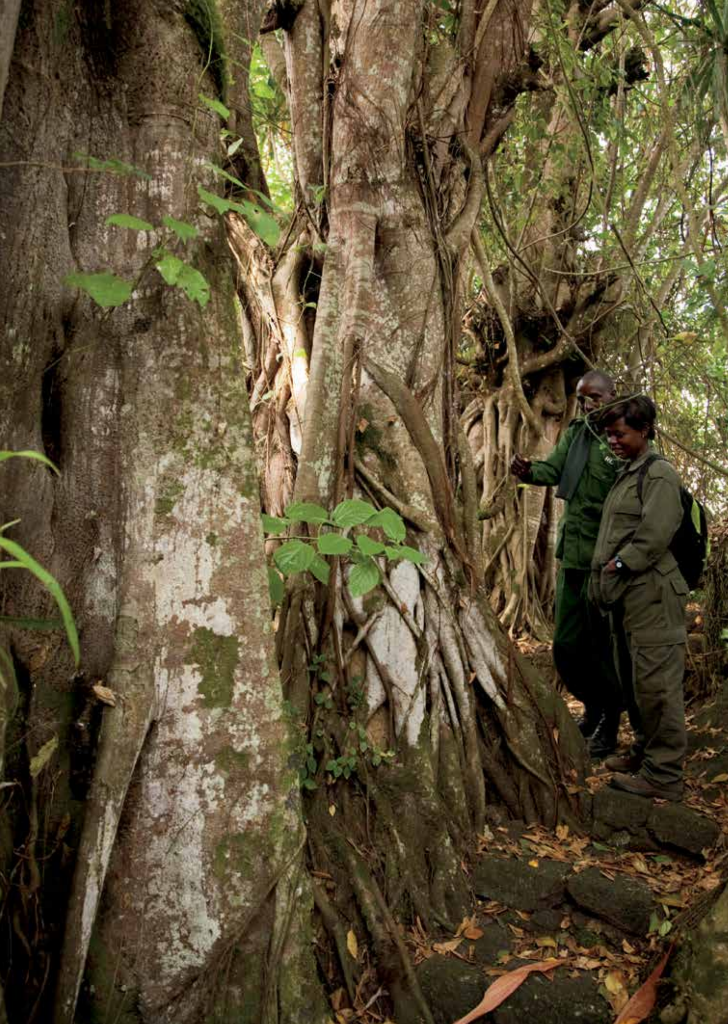
left: Magical tree in Buhanga Forest right: Rwanda's crowned crane is one of the protected species