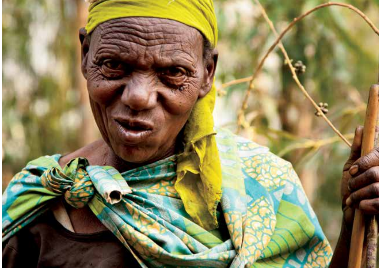
left: Peasant woman on her way to the field right: Collecting water is women's work