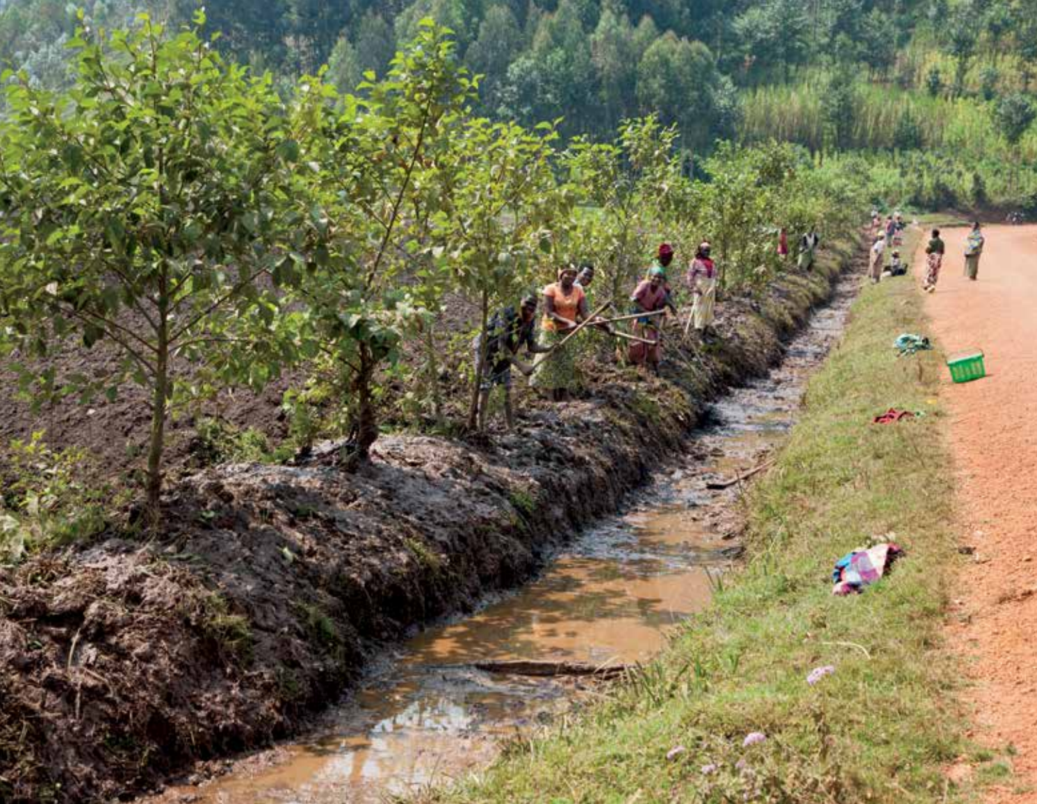
left: Digging a drainage ditch together right: Teamwork in terrace construction