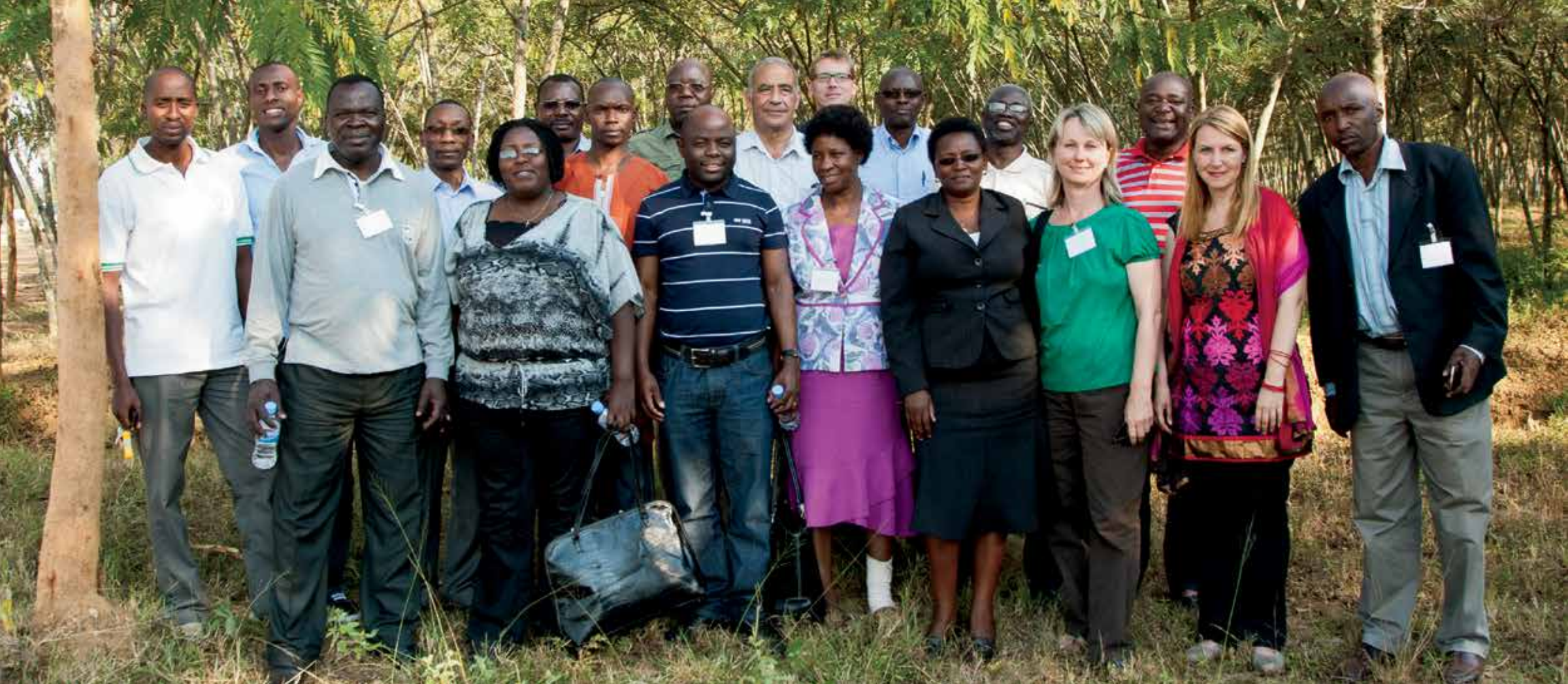
right: Tree of Unity in Buhanga Forest left: The conference participants on fact finding mission