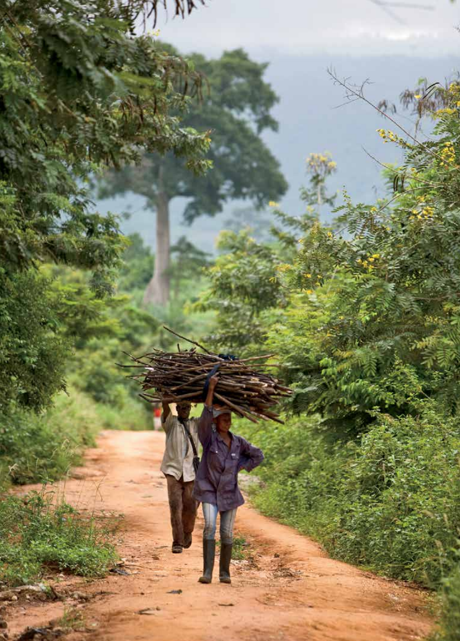
left: Women collecting firewood right: Cecile Nyirabahutu makes briquettes from used paper