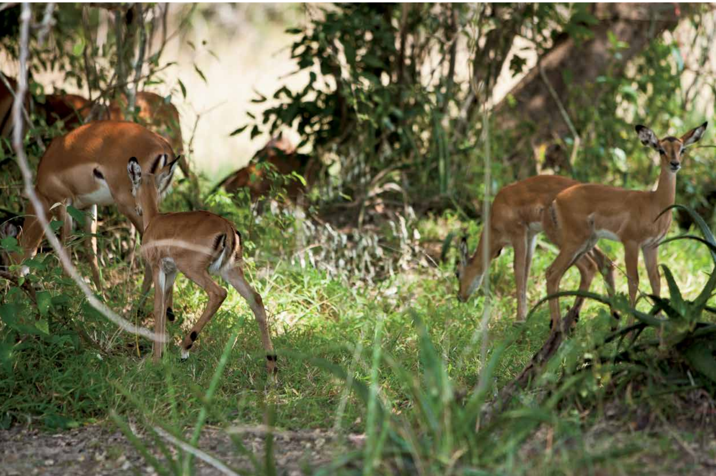
right: The “Old Chief” in Akagera National Park left: Group of impalas in Akagera National Park