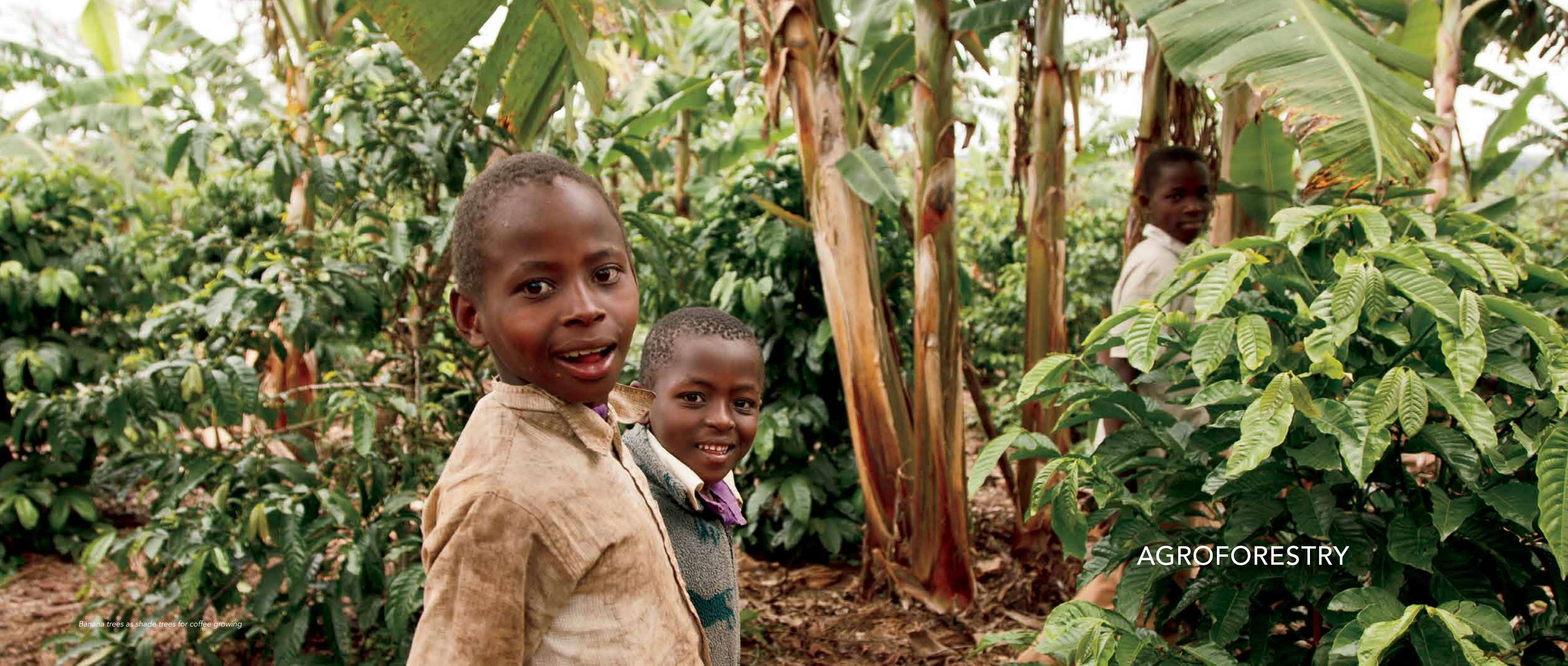
Banana trees as shade trees for coffee growing