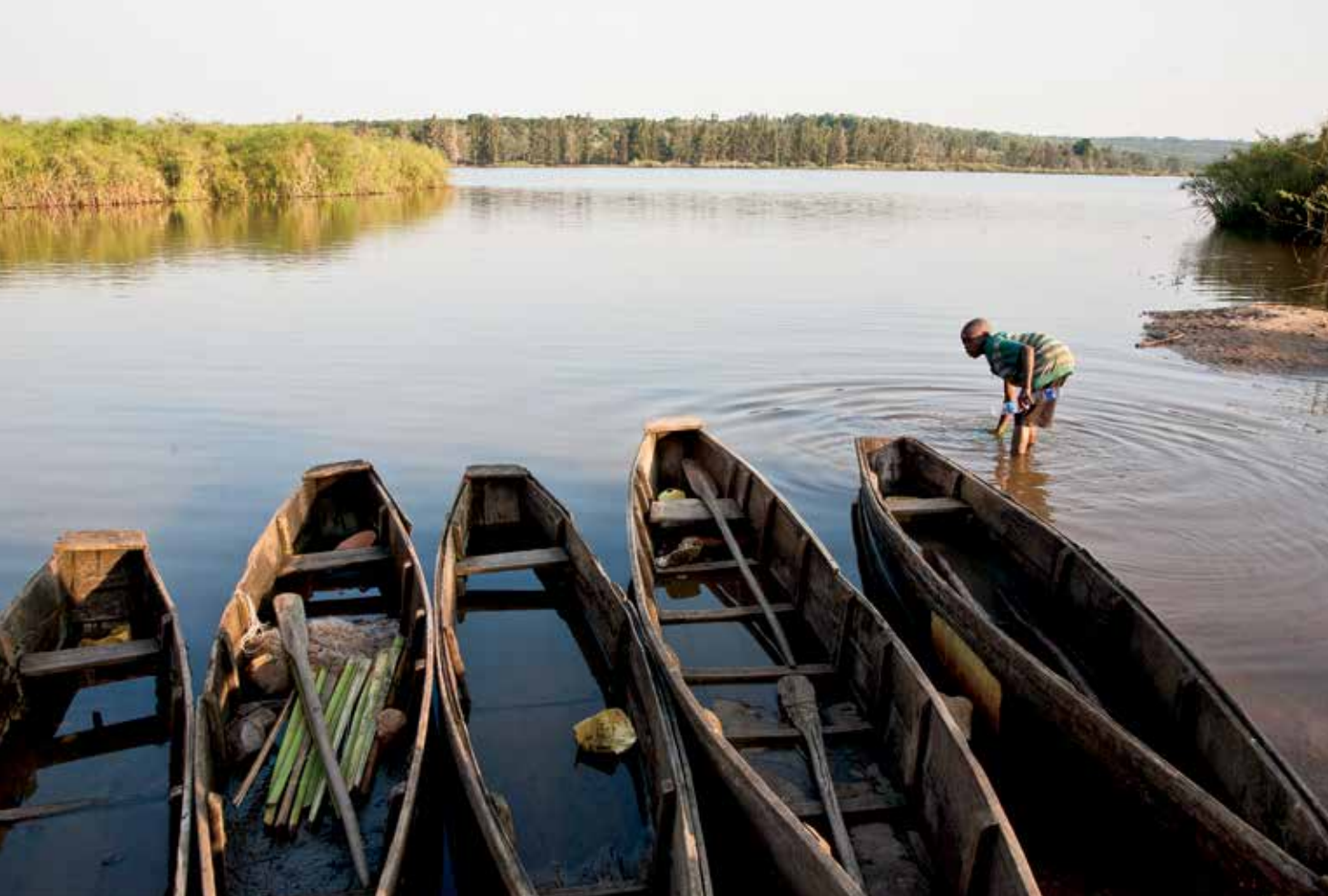
above left: Clean lake in Rwanda below left: Waste at a lake in Madagascar right: Waste separation even in rural areas