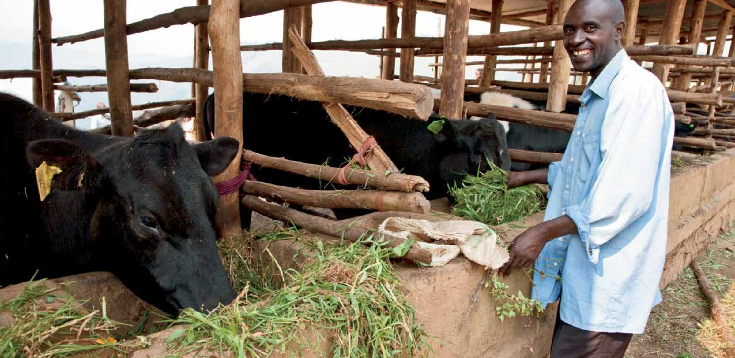
above: The cows of Rubaya village right: The biogas plant produces biogas for cooking