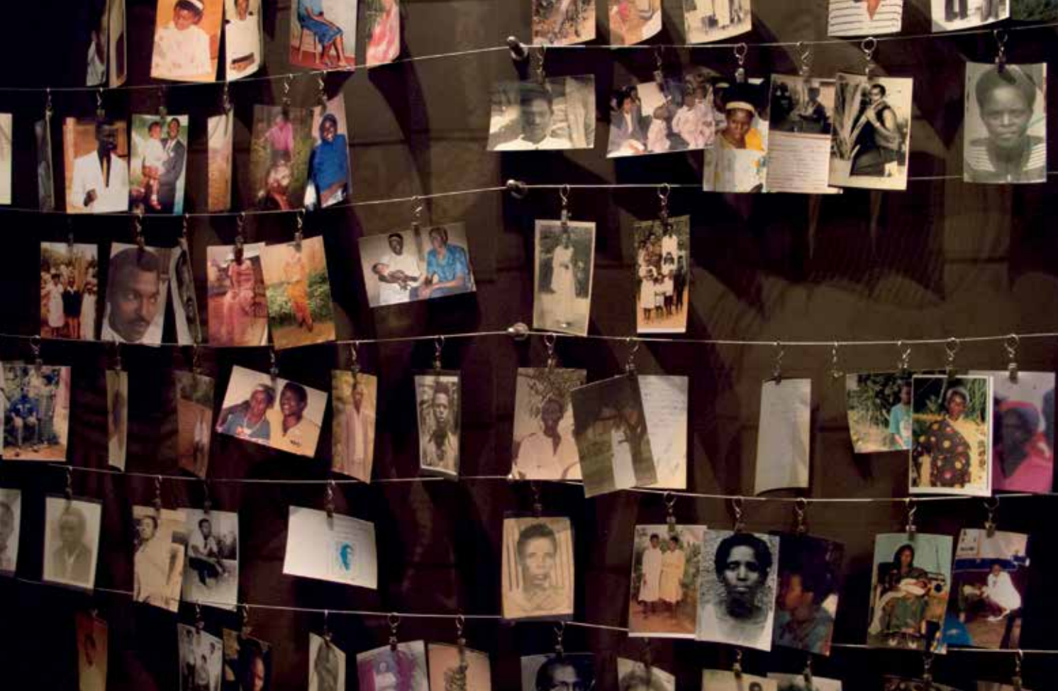
left: At the Kigali Genocide Memorial Centre right: Cheerful reception in Rubaya