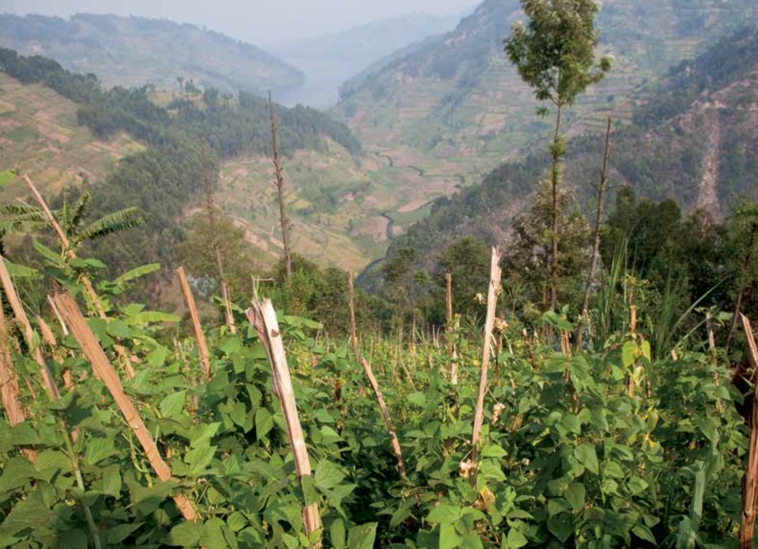
left: Bean field overlooking the valley right: Coffee harvest