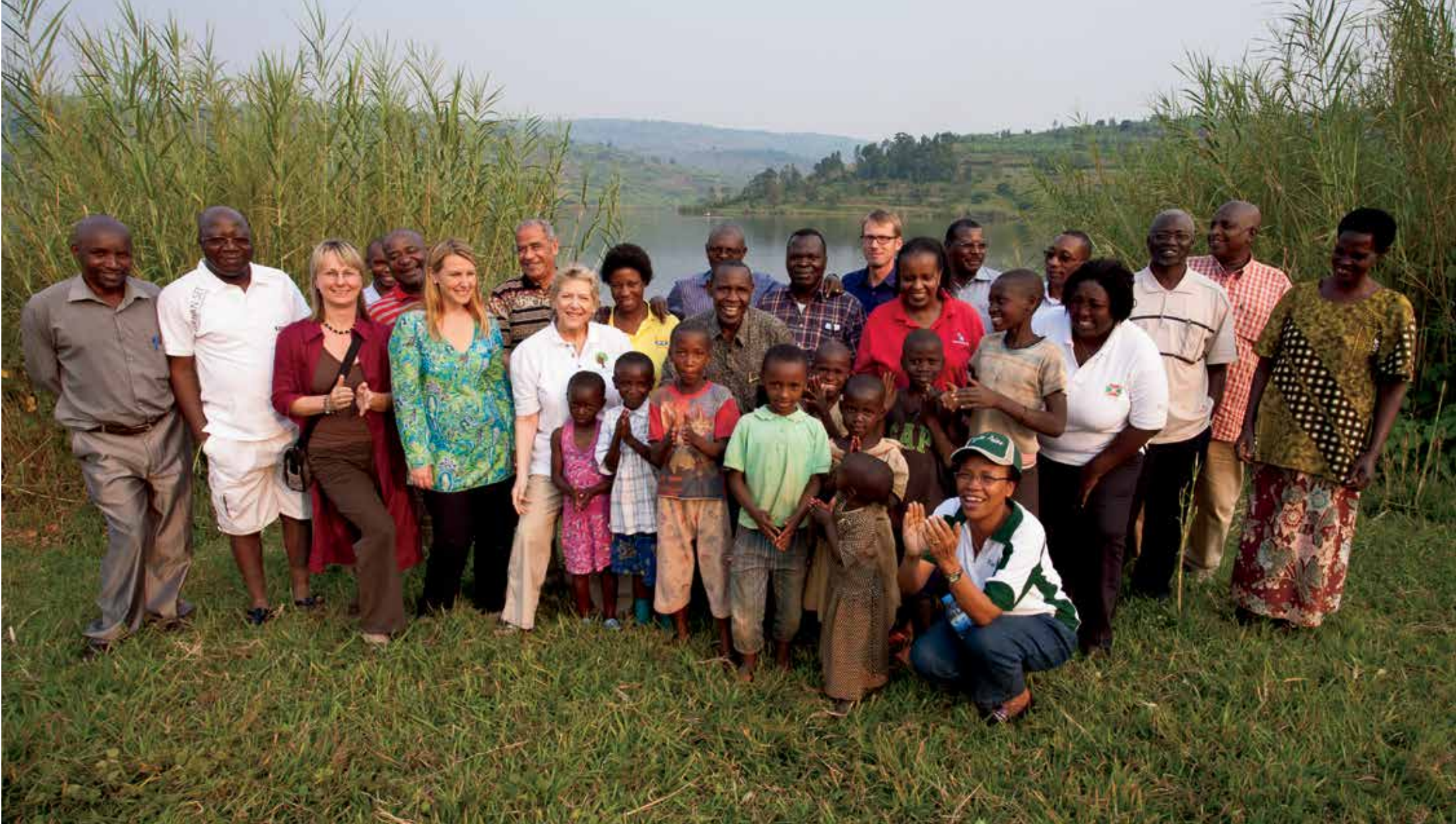
above: Participants of the Kigali Conference left: Buhanga Forest

For this reason we organised a conference in the Rwandan capital of Kigali in July 2012. We invited members of parliament, government representatives and experts from neighbouring countries, including Cameroon, Burundi, Malawi, Tanzania, Uganda and Zambia as well as Ghana and South Africa. Specialists from Rwanda and other participating states presented their solutions for achieving good forest policy. The principle of "seeing is believing" also holds true in Africa – perhaps even more so than in other regions. Consequently, the conference included excursions into the countryside and dialogues with local people.