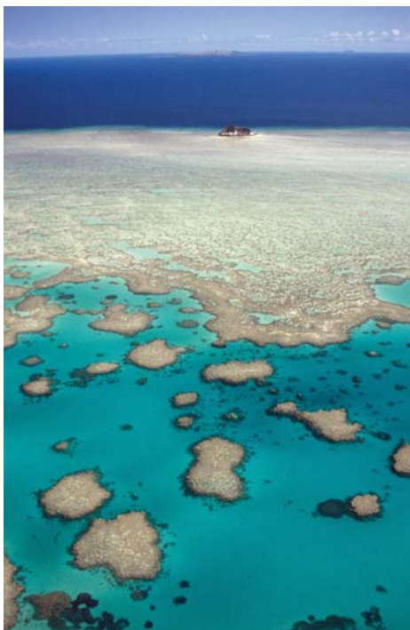
The Great Barrier Reef is the world's largest and most intact coral reef system extending over 2,500 km.

is set aside in highly protected 'no-take' areas. A new network of 'no-take' zones representative of all 70 bioregions has been created. One third is set aside where trawling or related activities that damage seabed habitat and communities are excluded, some additional very small 'no-go' areas are set aside for scientific research. A minimum of 20% of every bioregion throughout the Marine Park became highly protected (115,000 sq km). This approach ensured at least 20% of the predicted biomass of both known and yet-to-be discovered species was safe in highly protected zones. The software that enabled such precise protection is now widely used around the world. High levels of public participation helped to ensure that local